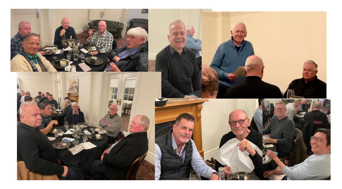
Happy Snaps Luncheon August 2024